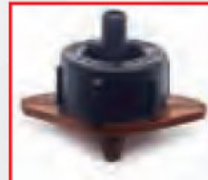
Brown Base nominal flow rate 16 l/h

Office : 72-B Gulberg II Lahore - Pakistan Tel : +92 42 35790637-8 , Mob : +92 300 8711434 Email : info@hsinternational.pk , URL : www.hsinternational.pk