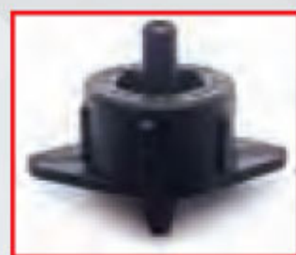
Black Base nominal flow rate 4 l/h