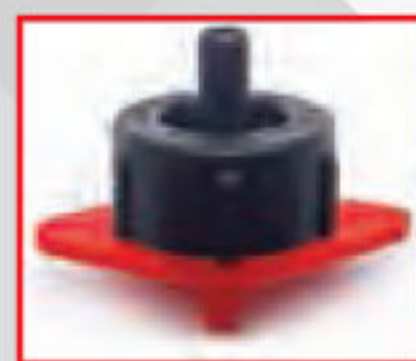
Red Base nominal flow rate 8 l/h